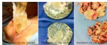
Removal of a Dow Corning Breast Implant and scar tissue