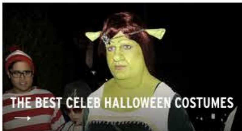
THE BEST CELEB HALLOWEEN COSTUMES