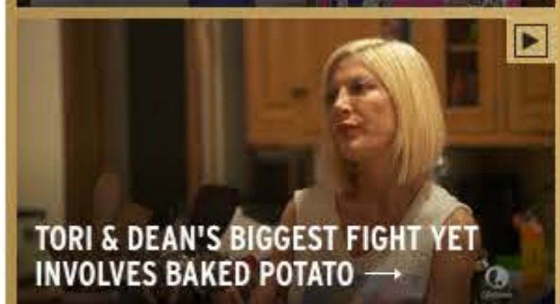
TORI & DEAN'S BIGGEST FIGHT YET INVOLVES BAKED POTATO →