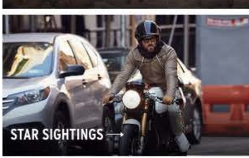
STAR SIGHTINGS →