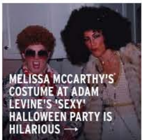
MELISSA MCCARTHY'S COSTUME AT ADAM LEVINE'S 'SEXY' HALLOWEEN PARTY IS HILARIOUS →