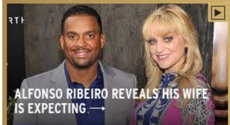
ALFONSO RIBEIRO REVEALS HIS WIFE IS EXPECTING →