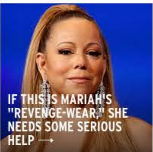
IF THIS IS MARIAH'S 'REVENGE-WEAR,' SHE NEEDS SOME SERIOUS HELP →