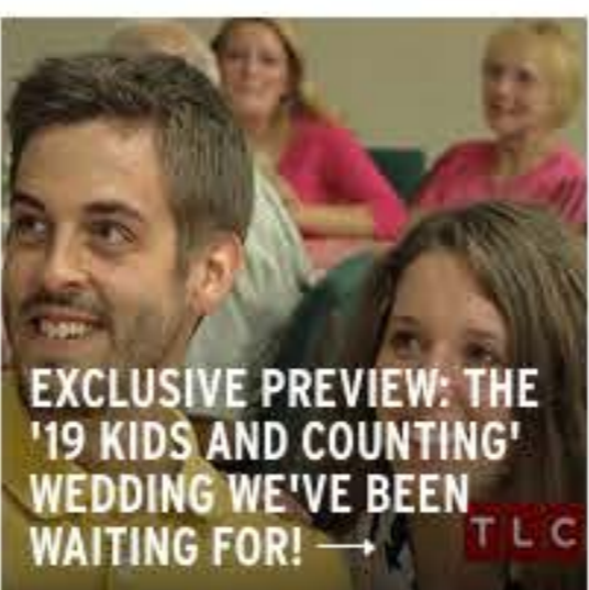
EXCLUSIVE PREVIEW: THE '19 KIDS AND COUNTING' WEDDING WE'VE BEEN WAITING FOR! →