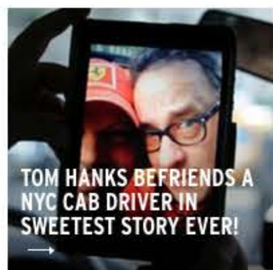
TOM HANKS BEFRIENDS A NYC CAB DRIVER IN SWEETEST STORY EVER! →