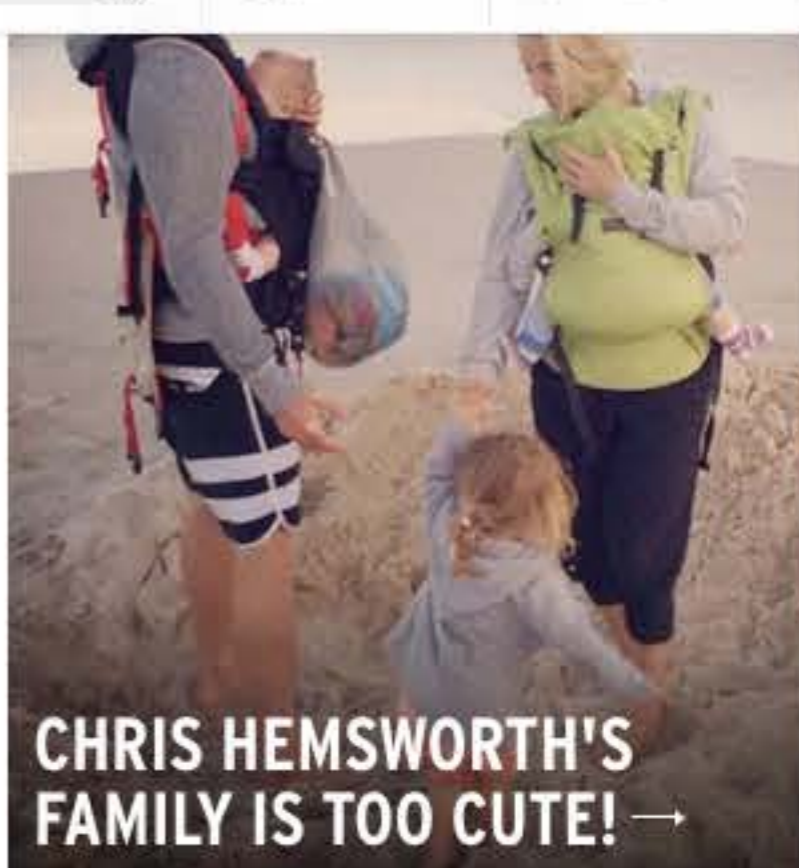
CHRIS HEMSWORTH'S FAMILY IS TOO CUTE! →