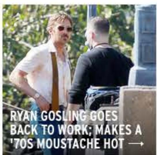
RYAN GOSLING GOES BACK TO WORK; MAKES A '70S MOUSTACHE HOT →