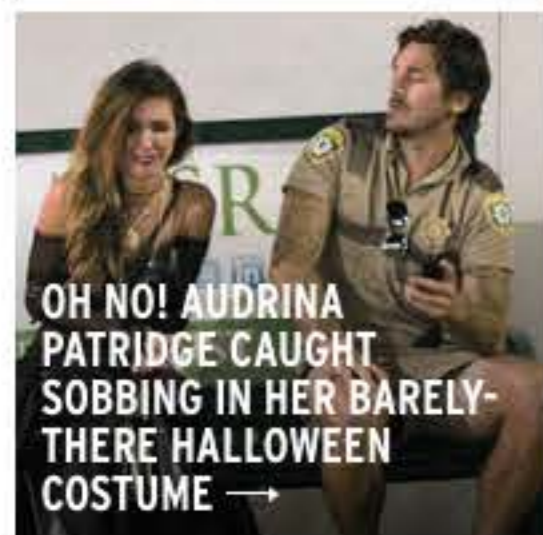
OH NO! AUDRINA PATRIDGE CAUGHT SOBBING IN HER BARELY-THERE HALLOWEEN COSTUME →