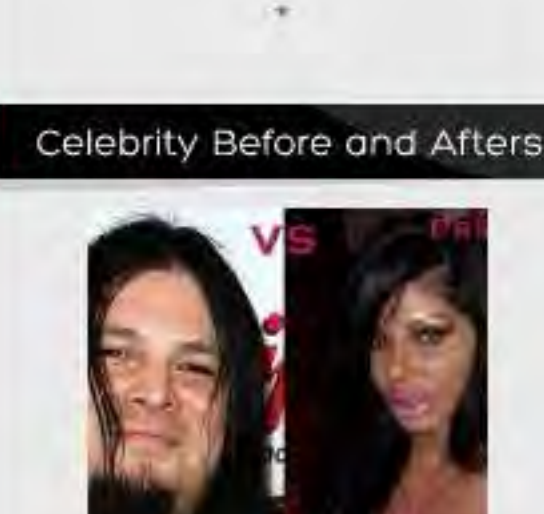
Album: The Mystery Russian Beast Takes on Danzig Bassist