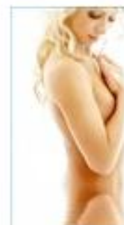
Augmentation revision serves both appearance and health.

The American Society of Plastic Surgeons reports that breast augmentation surgery has skyrocketed 36 percent between 2000 and 2009. Yet the procedure is far from an exact science. A variety of issues, including implant rupture, shoddy surgery, bodily rejection, and just a simple desire for aesthetic improvement, can lead to the need for augmentation revision surgery.